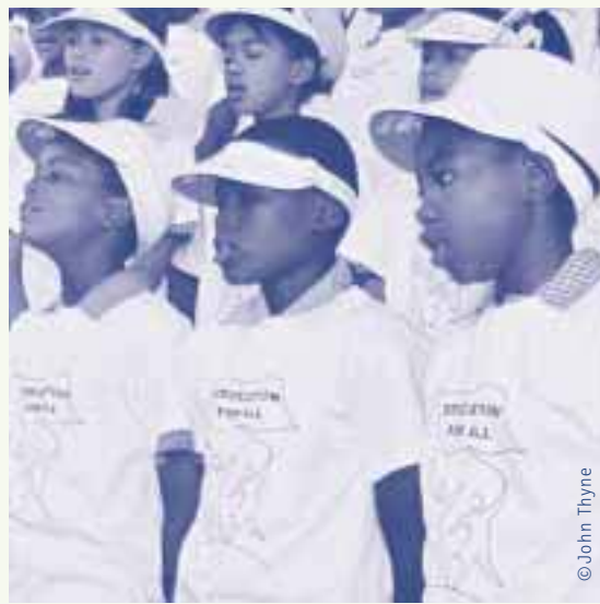
Children at Khomasdal and St. Andrew's Primary Schools in Windhoek, Namibia, sing an education song during EFA Week.

Following up on this success, a web-based petition to the G8 meeting at Evian (France, 1-3 June), initiated by NetAid, reminded world leaders of their promise to fund EFA generously.