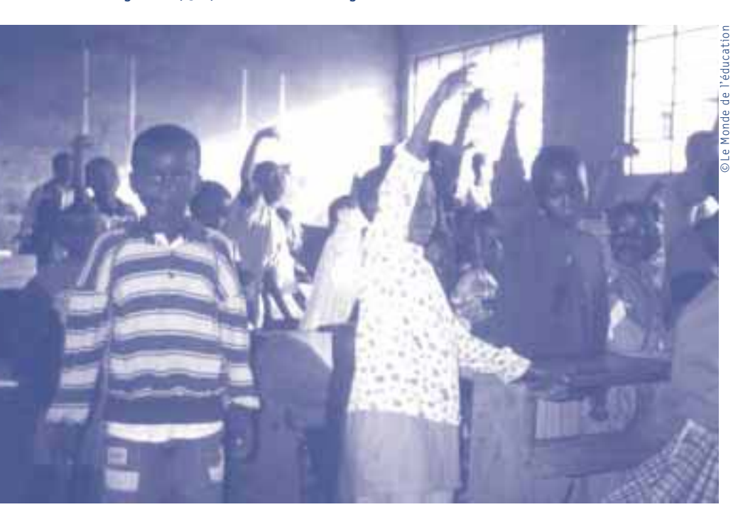
Children have to adapt to the classroom after years on the street

A longer version of this article was published in Le Monde de l'éducation, June 2003.