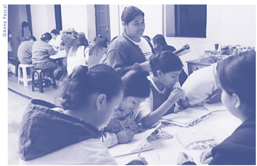
Most girls have been to school very irregularly and need to refresh their knowledge

A project to rehabilitate young girls puts an end to a life of begging, prostitution and drugs